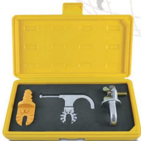
Carry case for the whole set accessories