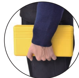
Small, lightweight, easy to carry