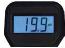
Momentary Backlight On