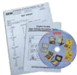
Test report Instruction manual CD