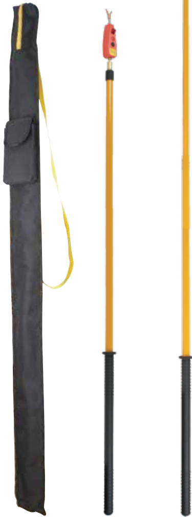
Soft Pouch 230 HD 290 HD