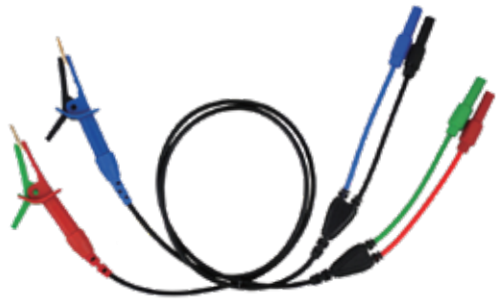
Model A: Silicon wire (100 mm)